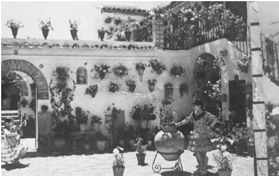
Figure 7 First PAX Cooperative. An historical photo when it was full of life and families living.