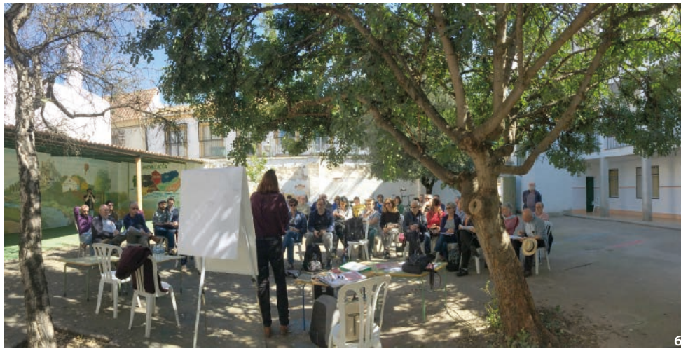
Figure 6 Meeting of the 'Right to the City' Forum in a courtyard of a public building on March 2019.