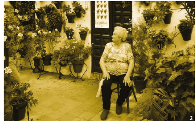
Figure 2 A typical patio house of the Axerquia with an old woman living alone (Source: Carlos Anaya).

rather, touristification. Perhaps it can be said that unfortunately, Spain has moved from a real estate bubble to a tourism bubble.