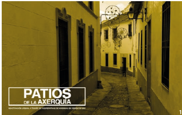
Figure 1 A typical street of Axerquia and PAX logo.