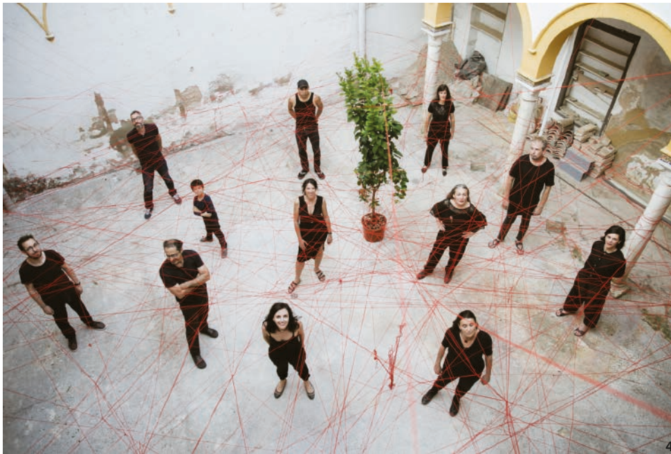
Figure 4 The PAX Team members during the installation done for the 15 th International Exhibition of Architecture. La Biennale of Venice (Source: Sergio Flores).

Recognised as part of the Faro Convention Network by the Council of Europe in 2018 for applying social heritage values in an urban context, PAX was invited to the 15 th International Architecture Exhibition La Biennale in Venice in 2016 (Figure 4) and has been declared a 'best practice' project by the Madrid City Council for improving the social economy in a neighbourhood (2018) and has been the subject of an article published in the internationally Italian magazine Abitare (Franzoia 2016).